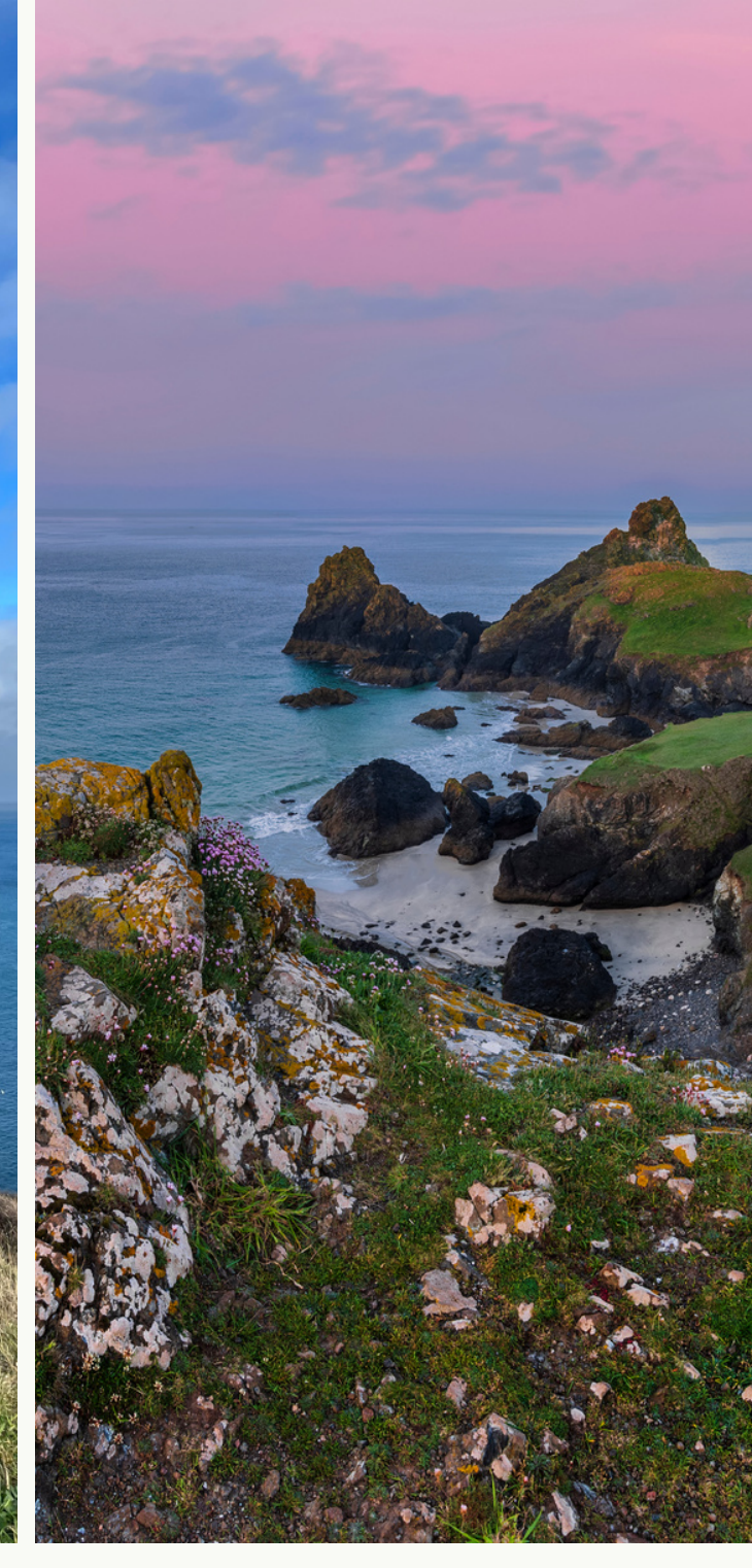
Housel Bay is hidden oasis, perfect for nature lovers, walkers and foodies.

Take a breath of fresh sea air, take time for mindful walking, go cliff running, experience cold water swimming or ride the waves surfing.