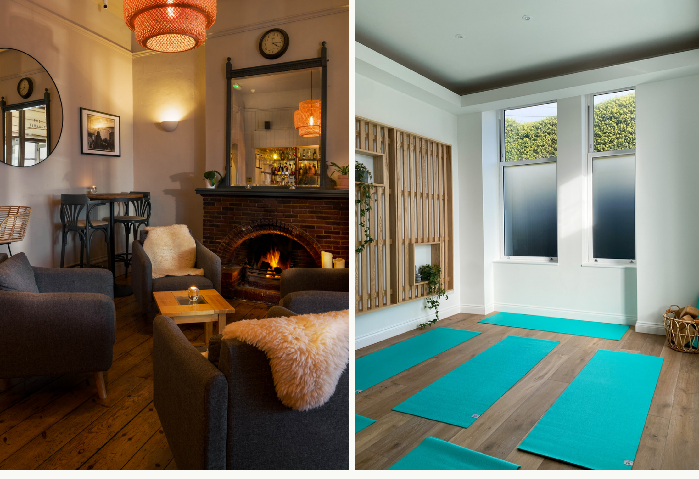
~ THE SPACES ~ Left ~ Marconi's Bar Right ~ Our Studio Available for private use for exclusive retreats & holistic events.