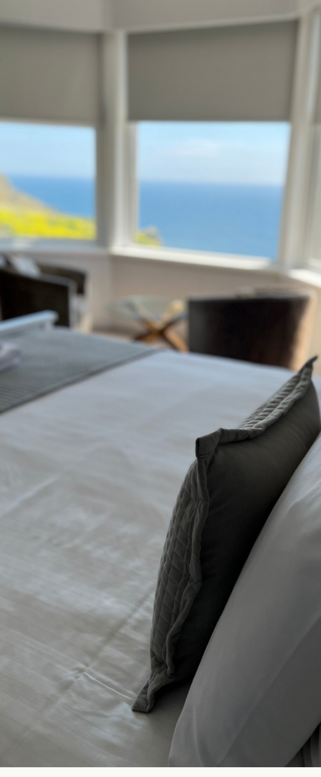
Rooms. Special features; Comfy beds, ensuite bathrooms, and Smart TVs.

Available for exclusive hire October - May.