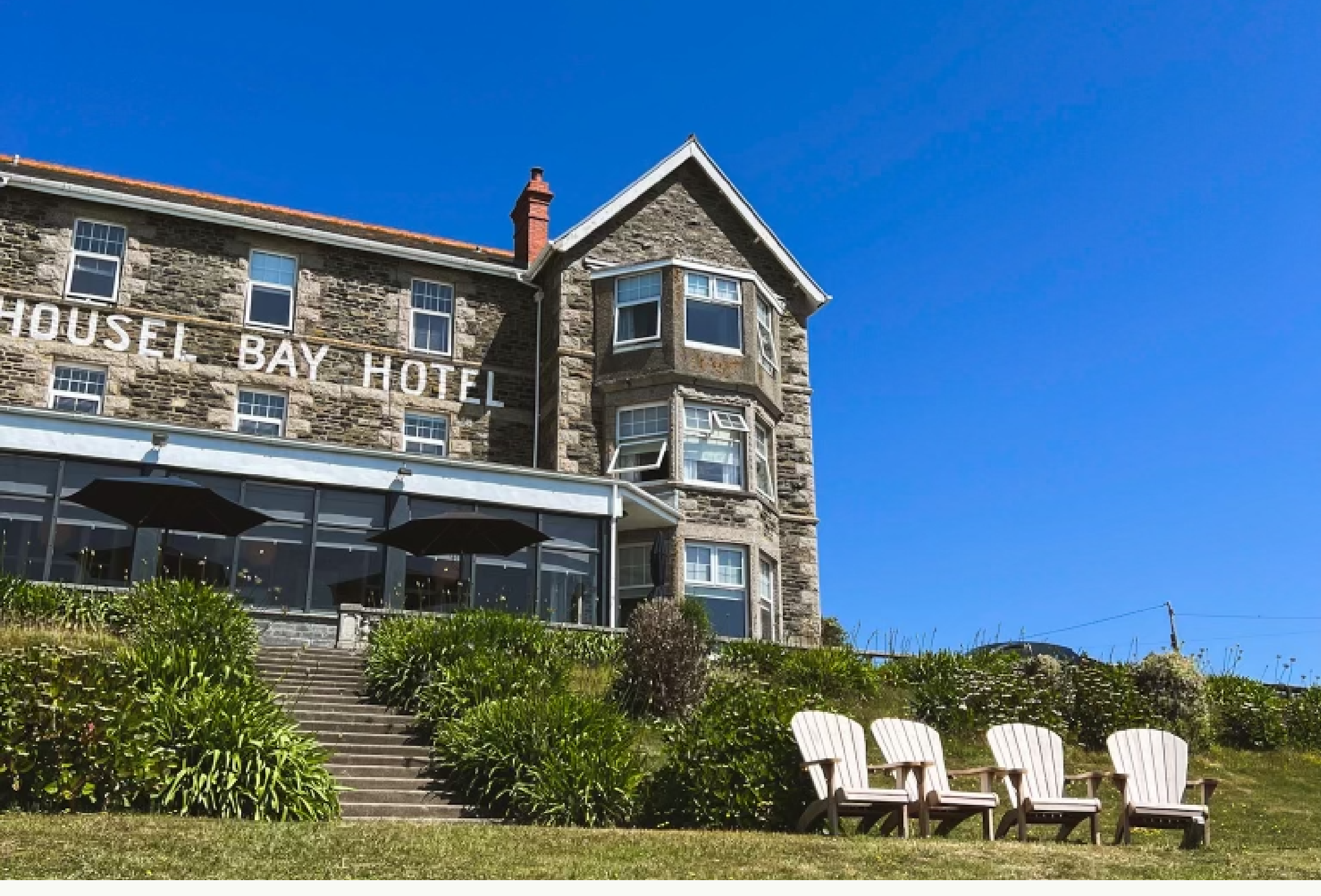
Some rooms are newly refurbished, with a contemporary design, and others include original Victorian features.